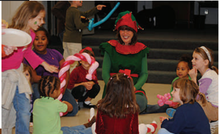
Jingles the Elf playing a good old fashioned game of Duck, Duck, Goose