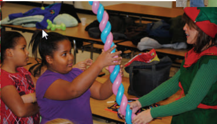
Jingles making wonderful balloon candy canes for all the girls and boys

Please step up and volunteer for the next event. More help than from the same few is needed.