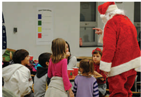
Santa visiting with all our good little boys and girls!! THANK YOU SANTA!