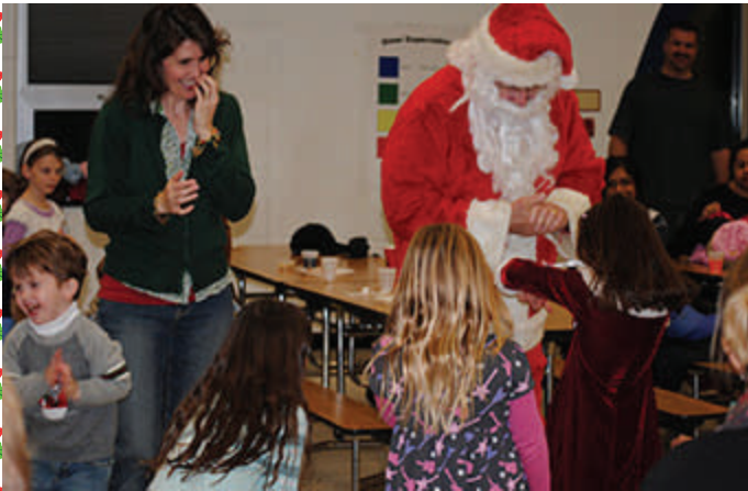
Kids and adults so happy to see Santa

Friday, December 11, 2009 Saratoga Elementary School